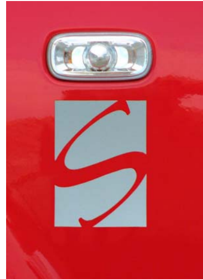
Incorrect ("S" upside down)